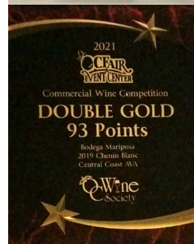
Above: WineCompetition.com website