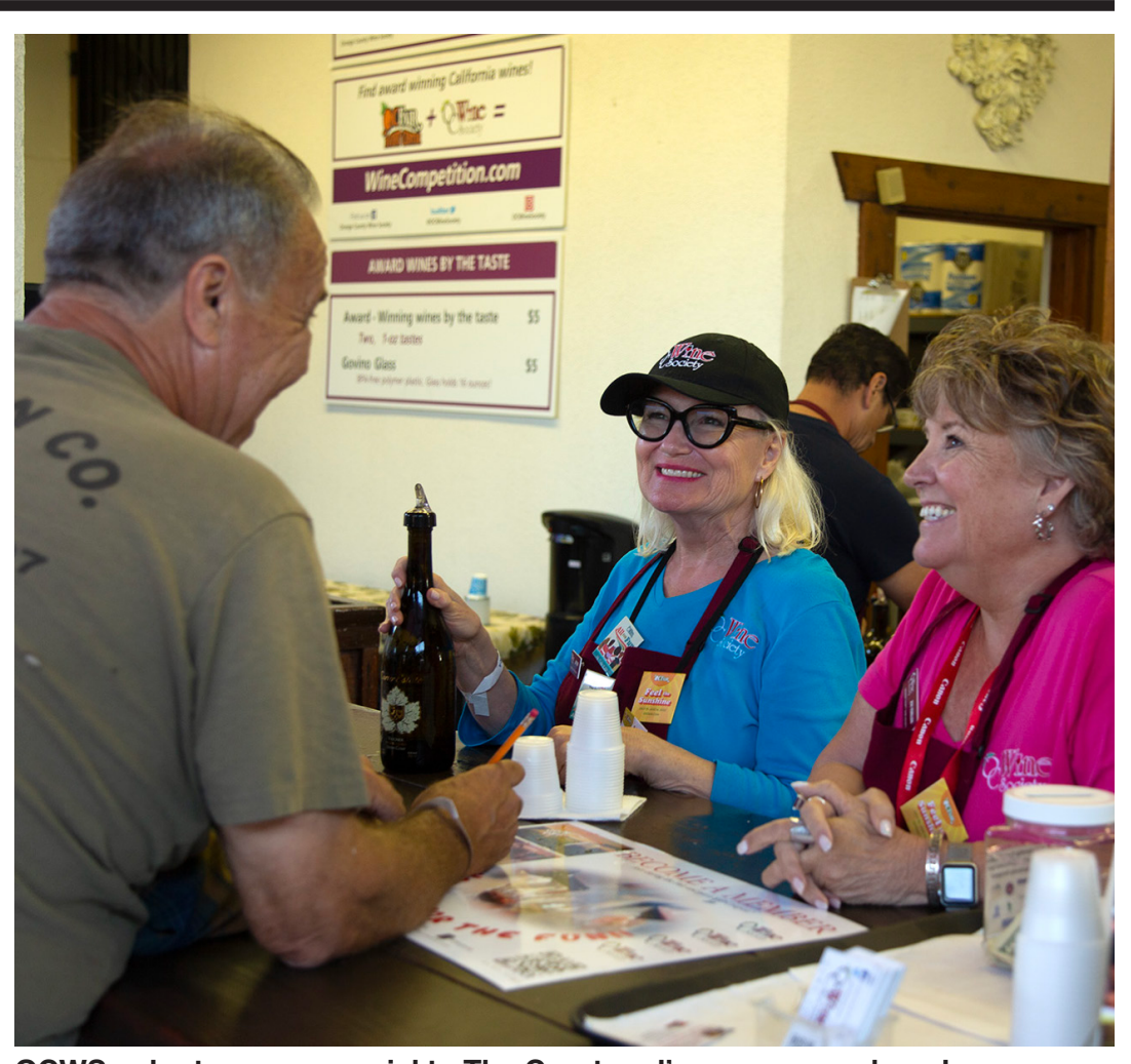
OCWS volunteers are crucial to The Courtyard's success each and every year.