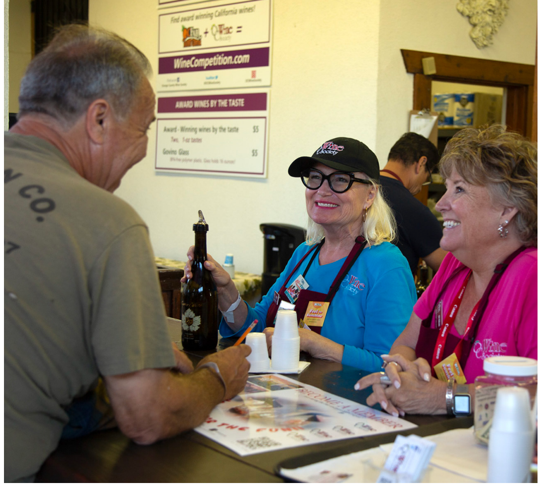
OCWS volunteers are crucial to The Courtyard's success each and every year.