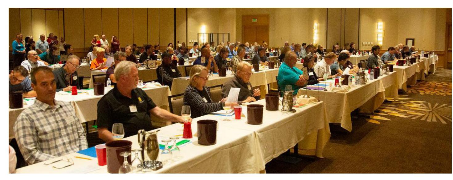
Volunteers and judges make the OCWS Commercial Competition a success each and every year.