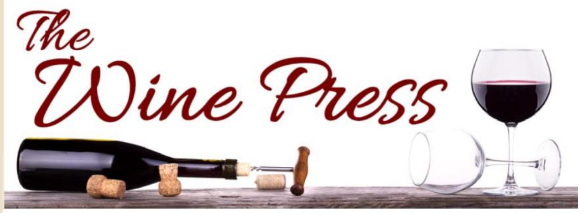
Newsletter of the Orange County Wine Society, Inc.