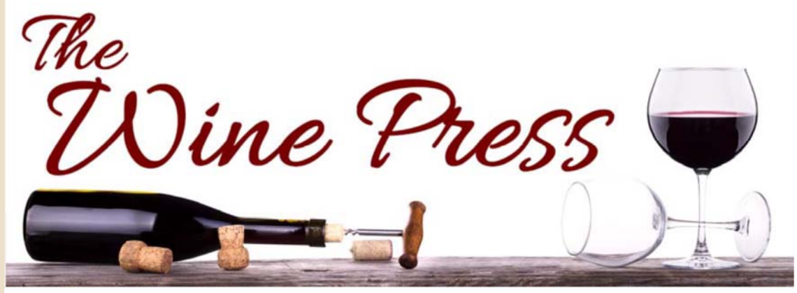
Newsletter of the Orange County Wine Society, Inc.