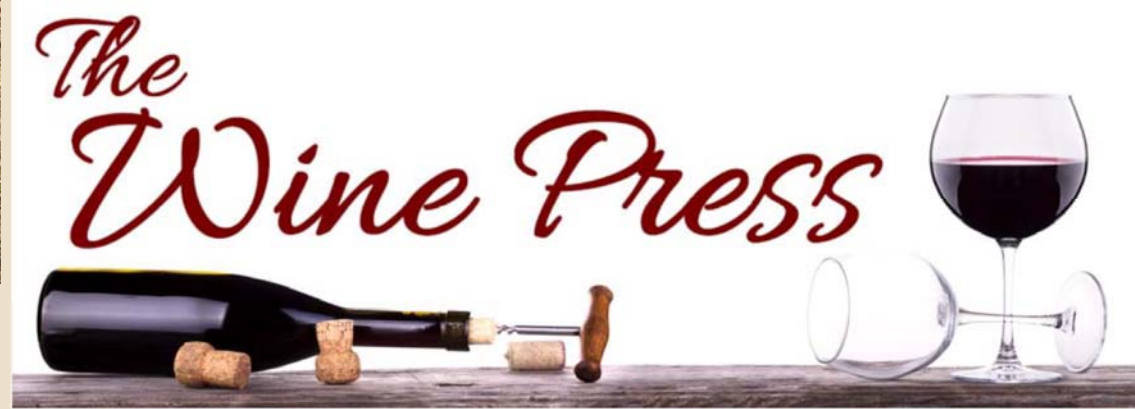
Newsletter of the Orange County Wine Society, Inc.